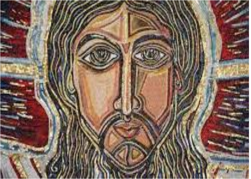
Closeup of mosaic of the face of Christ, courtesy of the Church of the Transformation, Orleans, MA

TO BE LOVING, SERVING, AND ACCEPTING OF ALL PEOPLE WITH GOD'S LIFE-CHANGING POWER AND GRACE